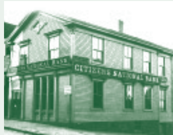
Citizen's National Bank, corner of North Water and Centre Streets, ca. 1890