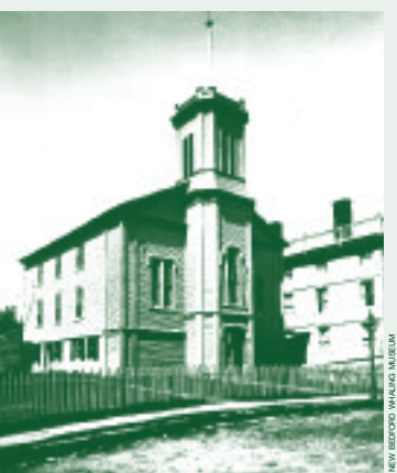
Seamen's Bethel, ca. 1860

In this same New Bedford there stands a Whaleman's Chapel, and few are the moody fishermen, shortly bound for the Indian Ocean or Pacific, who fail to make a Sunday visit to the spot. I am sure that I did not. —Herman Melville, Moby-Dick