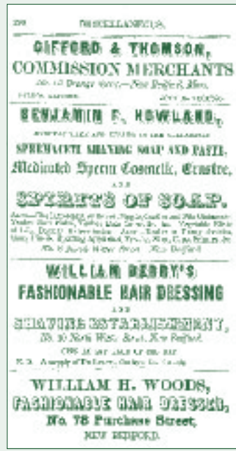
Advertisements from 1849 city directory

Choices for an overnight stay between the late 1830s and 1850 included several kinds of accommodations—some where a typical seaman could spend a brief overnight before shipping out,