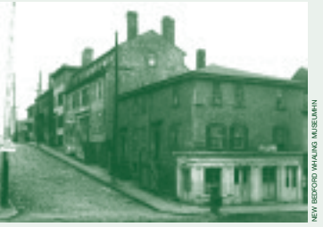
Johnny Cake Hill, looking north from Union Street, 1907

Built in 1832 by the New Bedford Port Society for the Moral Improvement of Seamen, the Seamen's Bethel has served the community as "a place of meeting for religious purposes for those who are temporary residents in our town and whose business it is to follow the sea." In the nineteenth century, the Bethel provided an alternative setting for religious services that were originally given by Bethel chaplains on the decks of ships in port. The Seamen's Bethel offered a moral oasis amidst the many boardinghouses and taverns located in the waterfront area. Concerned citizens hoped that the