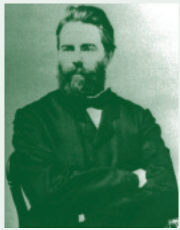
Photo of Herman Melville by Rodney Dewey, 1861

Herman Melville wrote Moby-Dick at his home in Pittsfield, Massachusetts, a decade after his own whaling adventure. This brochure highlights some of the places that may have inspired Melville to write so vividly about the landscape of New Bedford in Chapters 2 through 13 of the novel. Though some buildings have long since disappeared, the city of New Bedford retains some of the landmarks and a good deal of the character that sparked Melville's imagination.