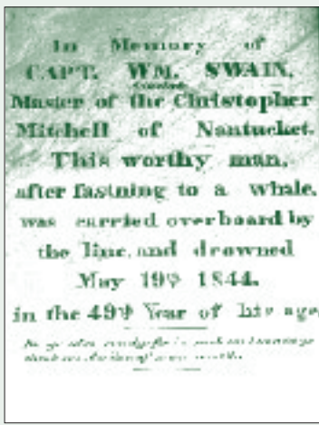
Cenotaph in Seamen's Bethel

The museum also hosts many special events connected to Melville during the year. Every January 3rd to 4th, New Bedford residents, Melville scholars, and other lovers of literature and the sea mark the anniversary of Melville's departure on the whaleship Acushnet by participating in a 25-hour marathon reading of Moby-Dick .