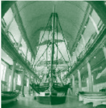
New Bedford Whaling Museum

The New Bedford Whaling Museum is the world's largest and most extensive museum dedicated to preserving the history of American whaling in the age of sail. The museum's collection and library archives are an enduring testament to the importance of the maritime experience that Melville so eloquently described in Moby-Dick . These artifacts, documents, whaling