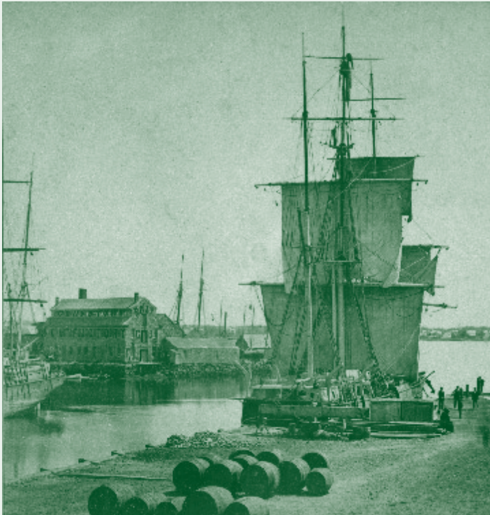
Bark Helen Mar at Central Wharf, New Bedford, September 1871.