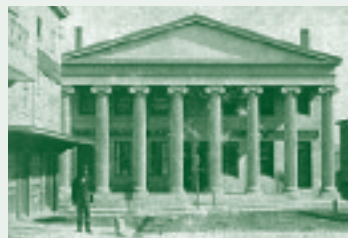
"Double Bank" building, North Water Street, ca. 1870

As its name implies, the Double Bank Building, constructed in 1831 at 60-62 North Water Street, once housed two