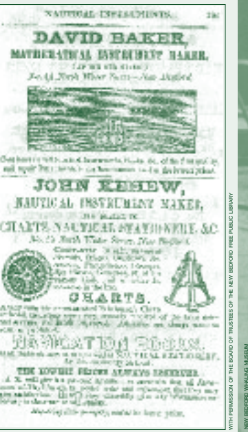
Advertisements from 1849 city directory

businesses also dotted the landscape and undoubtedly formed the backdrop for Melville's observations of the busy scene in Chapter 6 of Moby-Dick , "The Street." In 1840, a mix of working men, as well as New Bedford's elite walked along Water Street, creating a well-worn path from the wharves to the counting house to a myriad of financial, cultural and social institutions.