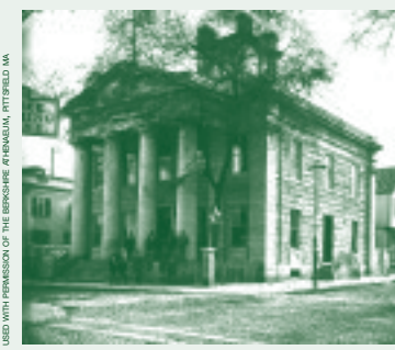
U.S. Custom House, ca. 1860

Melville may have registered at this custom house before setting out on