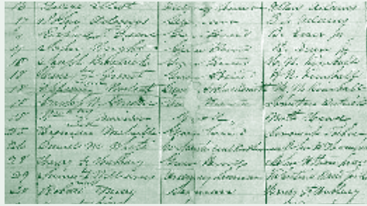
The Whalemens' Shipping Paper from the Acushnet . Herman Melville's entry is 25.

It is not surprising that Melville chose New Bedford as his point of embarkation. In 1841, the port was the whaling capital of the world, and its waterfront teemed with sailors and tradespeople drawn from every corner of the globe by the whaling industry's promise of prosperity and adventure. By 1823, New Bedford had surpassed Nantucket in the number of whaling ships leaving its harbor each year and by 1840, with the arrival of the railroad and easier access to markets in New York and Boston, the domination of the port was decisive.