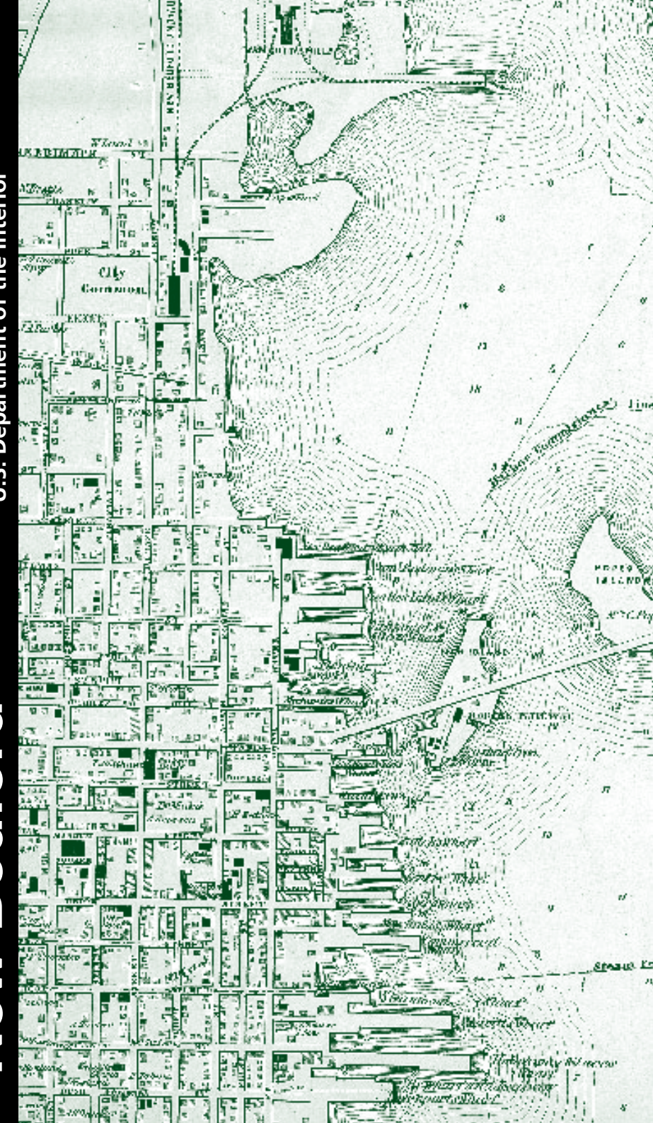
left: 1851 map of New Bedford

I thought I would sail about a little and see the watery part of the world.